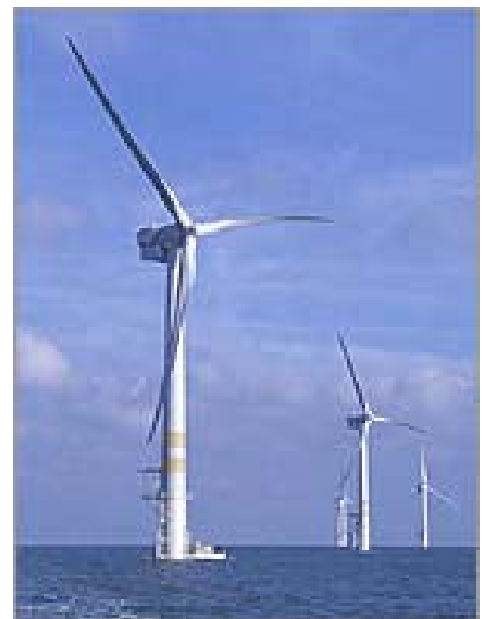
Wind Energy wind turbines are part of an offshore wind project off the coast of Ireland.