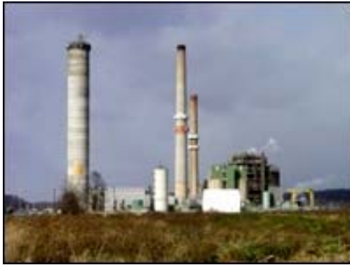
Brunner Island nuclear power plant in south central Pennsylvania USA.

The world is on the brink of peak oil production, with the price likely to double within a few years. Investors in the uranium mining industry (including superannuation funds) know that once oil hits a certain price, the uranium may as well stay in the ground, making their investment worthless.