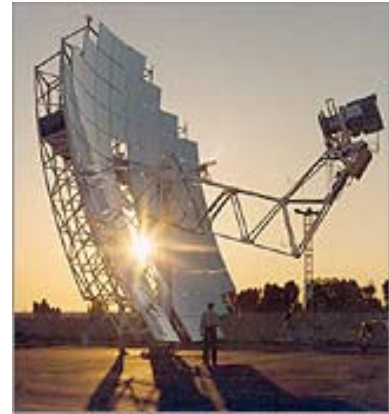
This solar dish-engine system is an electric generator that "burns" sunlight instead of gas or coal to produce electricity.

The intervening 33 years till 2040 allow for the discovery and further development of technologies to take us to 2100.